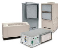
Water Source Heat Pumps ½ to 25 tons